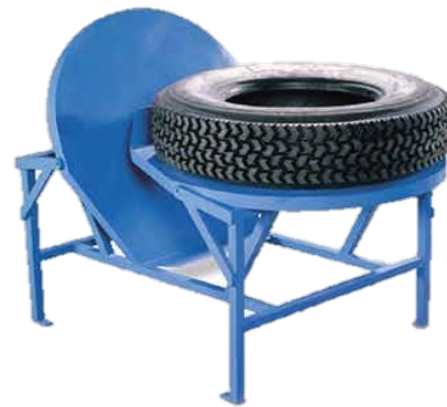
MODEL: AKR233 TREAD PREPARATION TABLE

Suitable for tires 700mm (27.5")-1450mm(57") Manually controlled two-direction tilting table